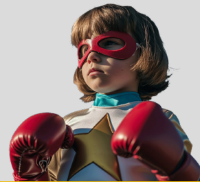
Knockout graphic design.